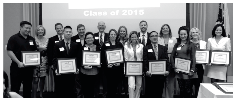
Members in pictures: the Leadership Fremont class of 2015 graduated on May 13 at Washington Hospital West Conrad Anderson Auditorium.

Located just north of Mission Boulevard off Appian Way, the 770,000 gallon capacity water storage tank helps to maintain uniform water pressure and provides water for firefighting and other emergencies in the Union City area. In addition to replacing the tank, the project includes the replacement of several thousand feet of transmission lines, as well as improved monitoring and control