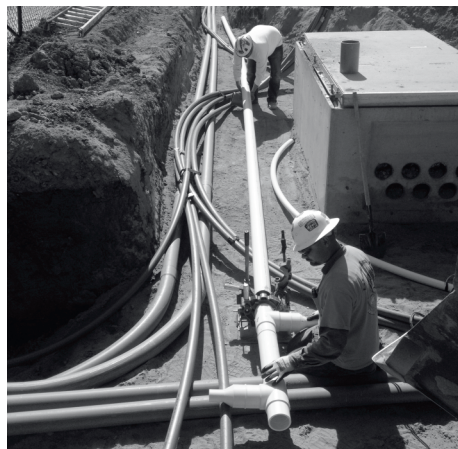
Construction on Capitol Avenue in downtown Fremont

Phase I of the Capitol Avenue Extension Project will be nearing completion this fall. The project kicked off last September with the Downtown on the Rise Demolition Celebration, where the community was able to witness the demolition of a three-story office building, allowing for the connection of Capitol Avenue to Fremont Boulevard. This fall, the community