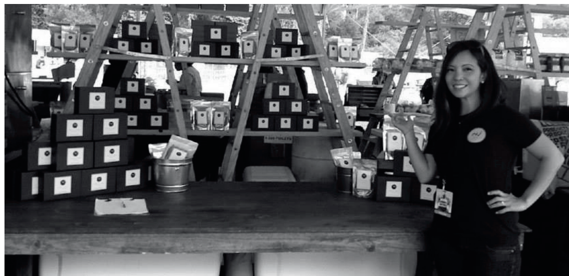
Top of page: Farm Fresh to You, 2 English Ladies Left: Oso Pepper Company Above: R & J Toffees