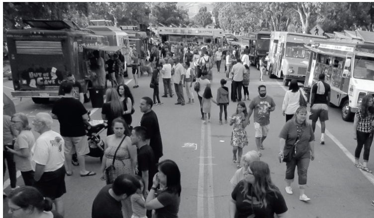
Fremont Street Eats takes place in downtown Fremont