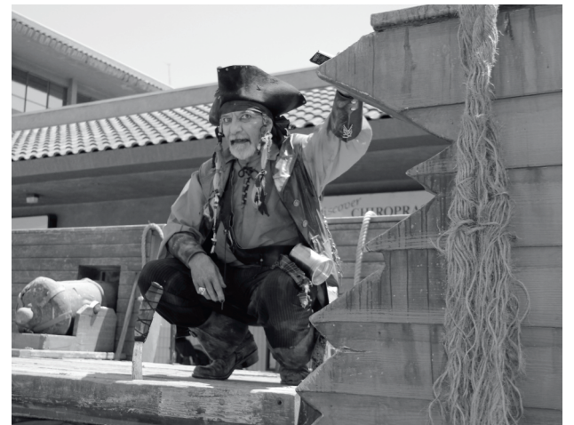
The Pirates of Emerson return to the Fremont Festival of the Arts in 2015