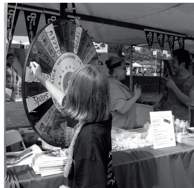
Ohlone College will be at the 2015 Business Marketplace

There's still time to join these 2015 participants (see below):