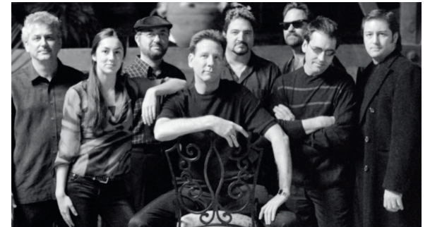
Above: Big Cat & the Hipnotics Below: Stealing Chicago