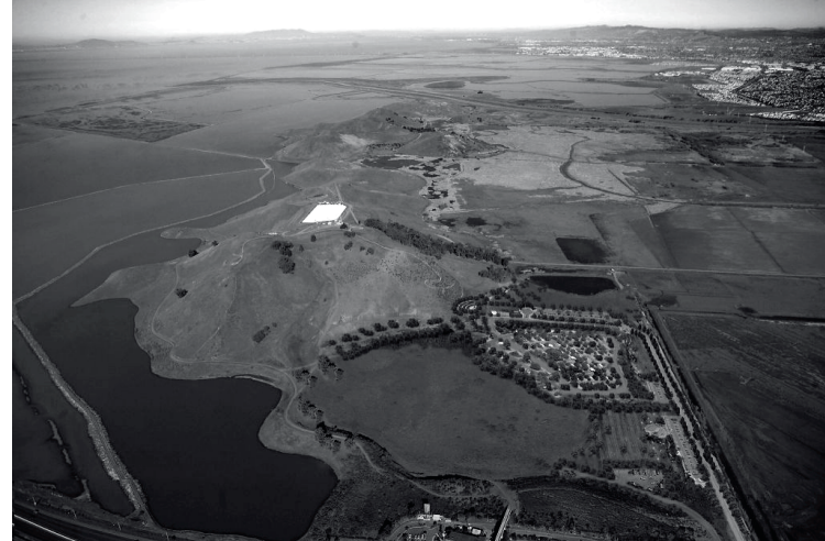
Left: A plan of the Dumbarton quarry park. Top image: The Dumbarton quarry's present condition. Above: Artist rendering of the Dumbarton quarry park.