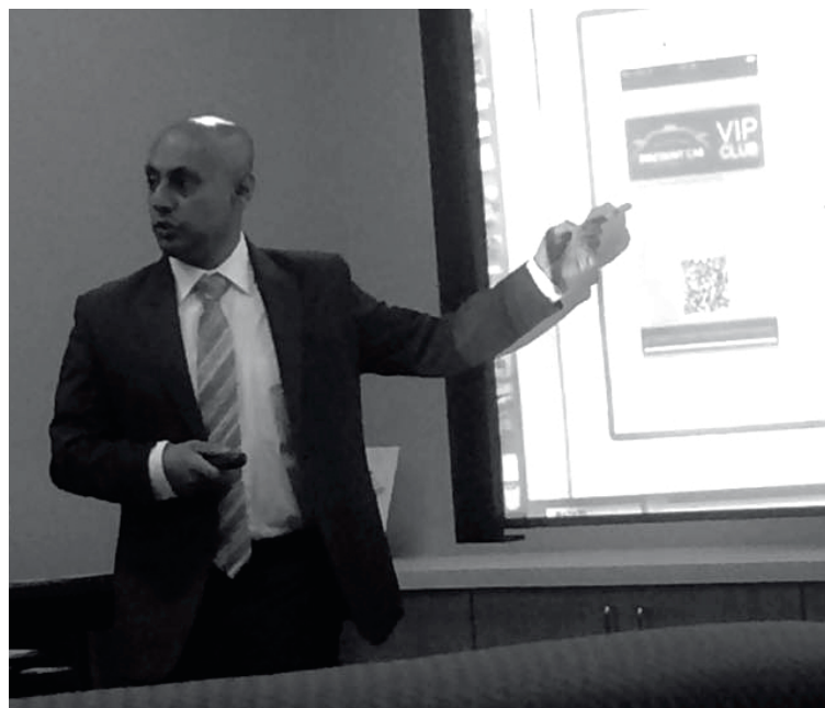
Above: Mobilewize Global presents a business building seminar at the Fremont Chamber of Commerce.