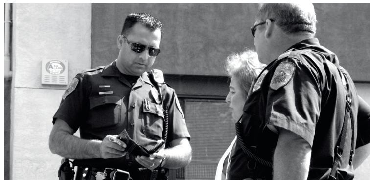
Report suspicious activity to the police department. Above: found wallets and cell phones should be turned in to Festival HQ or to the Fremont police. However, unattended packages should be reported immediately.