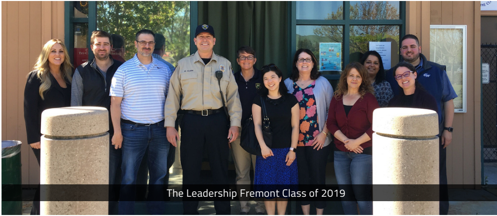
The Leadership Fremont Class of 2019

More than 200 leaders who live or work in the Tri-Cities have found Leadership Fremont to be an ideal venue for networking, community involvement and professional development. This is your opportunity to become one of them.