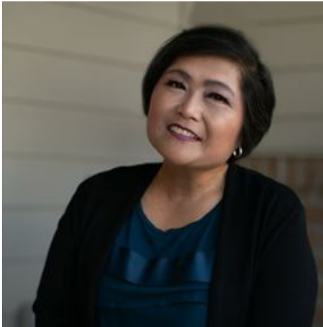
BY AGNES VELASQUEZ ELEGANT WEDDING DESIGNS

When it comes to planning your wedding, you want every detail to be as perfect and magical as you have envisioned all of your life. Whether you are planning a grand event or a small intimate gathering, a professional wedding designer will make the whole process less stressful.