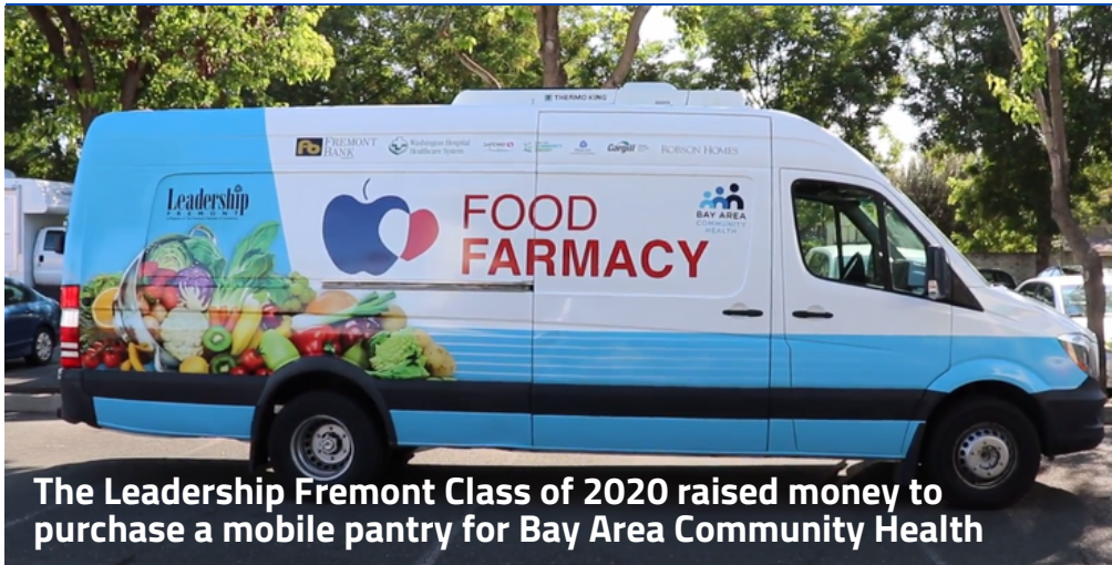
The Leadership Fremont Class of 2020 raised money to purchase a mobile pantry for Bay Area Community Health

areas; communication, team building and group dynamics, consensus building, public speaking and presenting, conflict resolution, time management, and managing transitions and change. This program is designed for those who are currently in leadership roles, or have been identified as potential leaders within their business or non-profit organization, or through their active role in the community. It is also designed for the individual who wants to take that next step in their career or in civic life. Does this program seem like a wonderful opportunity for you or a colleague of yours? The Fremont Chamber of Commerce is now accepting applications for our next cohort. Request an application today by calling 510-795-2244 or emailing fmtcc@fremontbusiness.com . The cost to participate is $1,000 if you work at an organization that is a current member of the Fremont Chamber and $1,500 otherwise, scholarships are available.