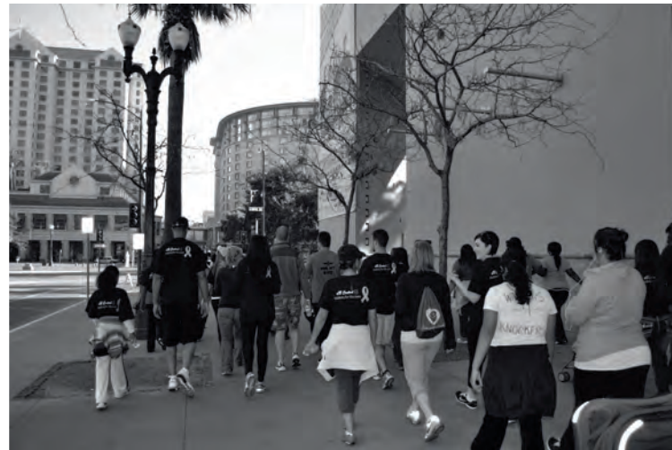
dB Control employees and family members at the Making Strides Against Breast Cancer walk

Please join companies like dB Control to support those in need here in Fremont and throughout the Bay Area by encouraging your