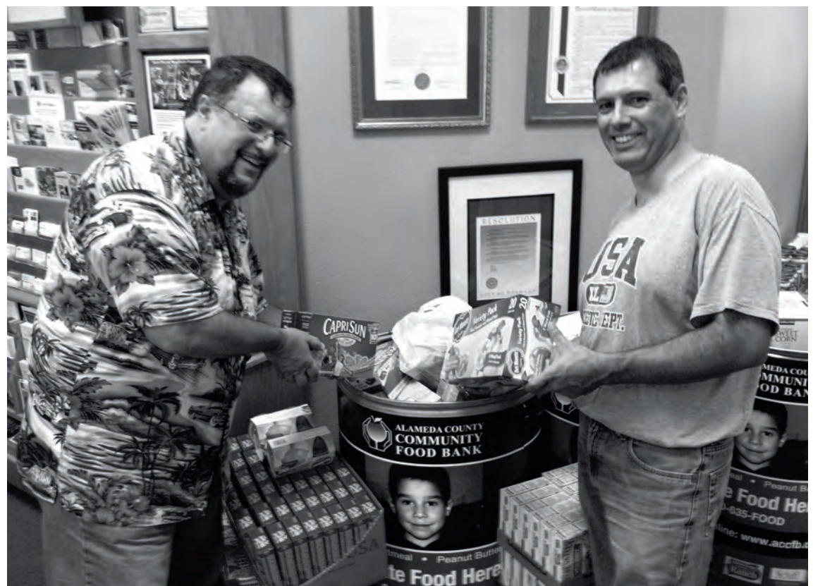
The Food Drive is a source of great pride and teambuilding for the Friday Club, an essential part of our identity.